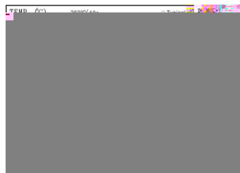
Wave Soldering (Flow Soldering)